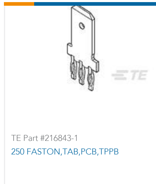
TE Part #216843-1 250 FASTON, TAB, PCB, TPPB