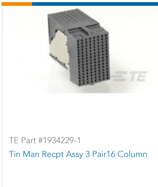
TE Part #1934229-1 Tin Man Recept Assy 3 Pair 16 Column