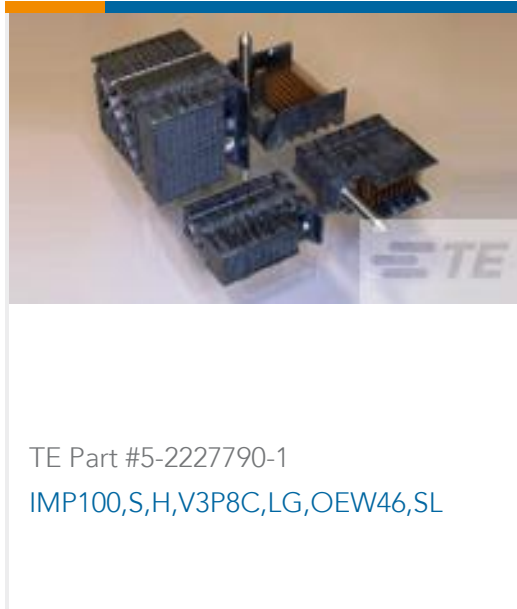
TE Part #5-2227790-1 IMP100,S,H,V3P8C,LG,OEW46,SL