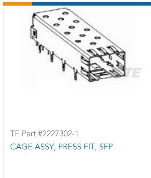
TE Part #2227302-1 CAGE ASSY, PRESS FIT, SFP