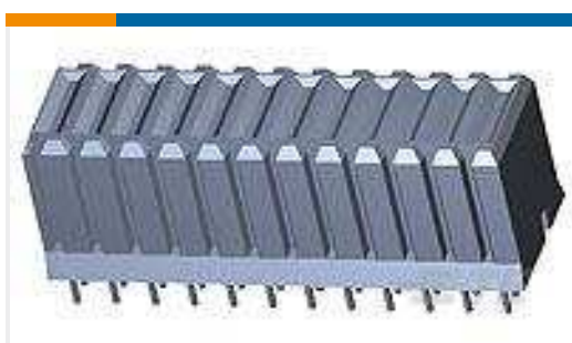
TE Part #120953-2 TE UPM Ver Receptacle 5P HC Power