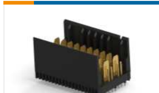
TE Part #2329186-1 HM-EZD+,2PAIRS,10COLS,VERTICAL, ASSEMBLY