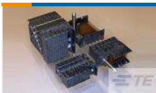
TE Part # 2057411-1 IMP100S,R,RA2P16C,UG,39