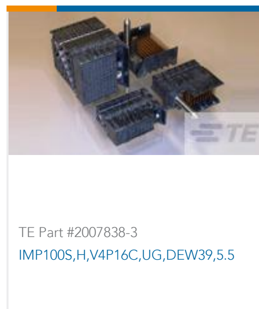
TE Part #2007838-3 IMP100S,H,V4P16C,UG,DEW39,5.5