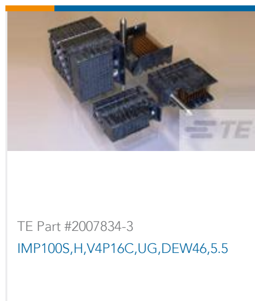
TE Part #2007834-3 IMP100S,H,V4P16C,UG,DEW46,5.5