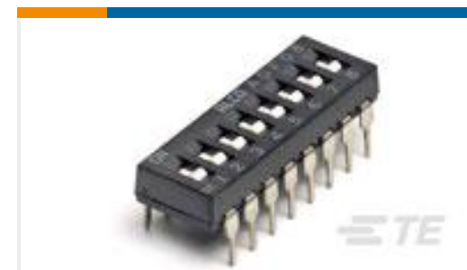
TE Part #1-1825002-7 ADF1004=DIP SWT,FLUSH,THRU/HL