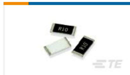
TE Part #4-1622825-6 RL73K 3A R27 5% 4K RL