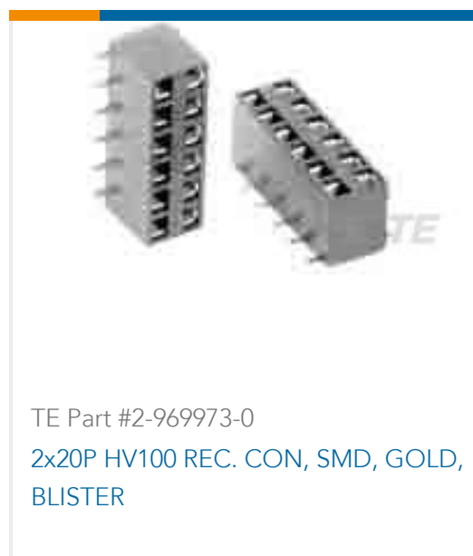
TE Part #2-969973-0 2x20P HV100 REC. CON, SMD, GOLD, BLISTER