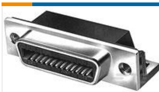
TE Part #5553813-3 ASSY,EMI RCPT,50 POSN,SCR LK