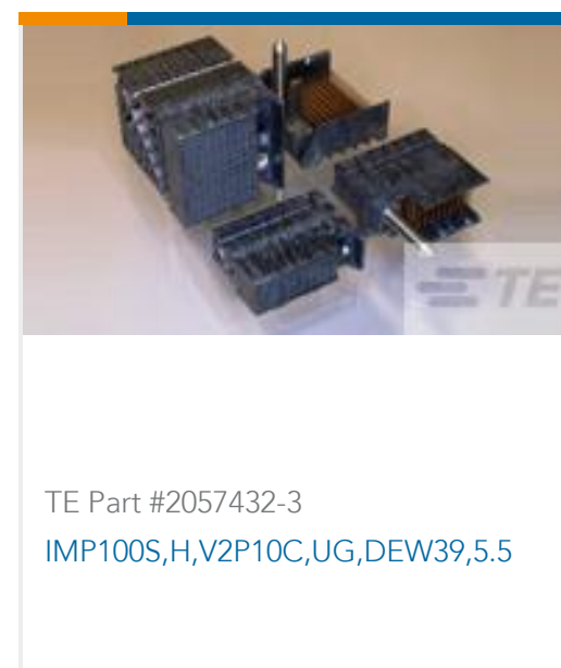
TE Part #2057432-3 IMP100S,H,V2P10C,UG,DEW39,5.5