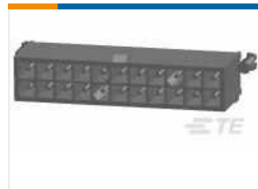
TE Part #1-794078-0 22P MINI UMNL HDR W/O DH SN LF