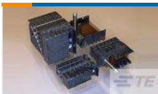
TE Part # 2057405-1 IMP100S,R,RA2P10C,UG,39