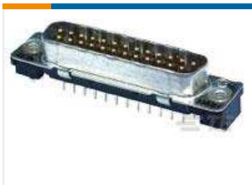
TE Part #1-5747871-3 09 PLUG SP/FMS SCRLK