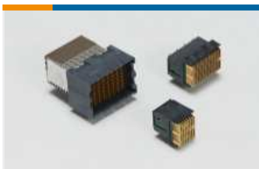
High Speed Backplane Connectors (1769)