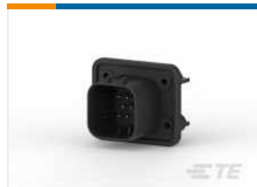
TE Part #776280-1 AMPSEAL PCB Horizontal Headers