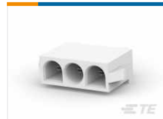
TE Part #1586077-1 03P UMNL PIN HDR ASSY W/O DRNS