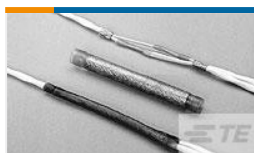
TE Part #621207-000 D-150-0174