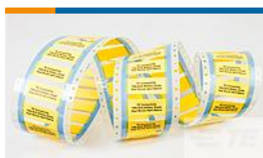
TE Part #5061850001 TMS-SCE-1/2-2.0-9