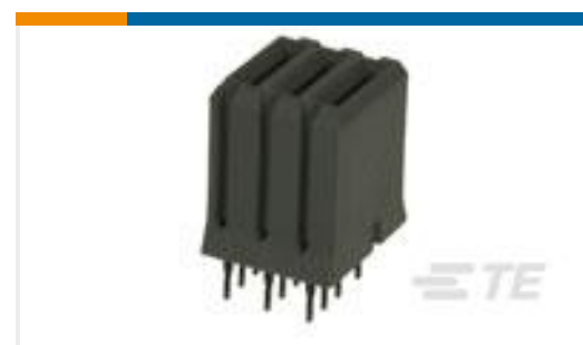
TE Part #5223955-2 TE UPM Ver Receptacle 3P STD Power