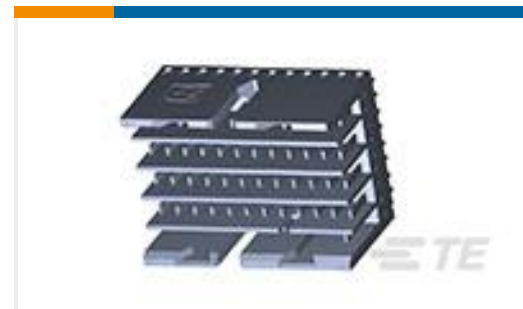
TE Part #1551099-1 Vert.Male, Telcordia Pre-post 1x