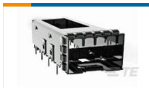
TE Part #2007198-2 SFP+ 1x1 Cage Assembly, Press-Fit