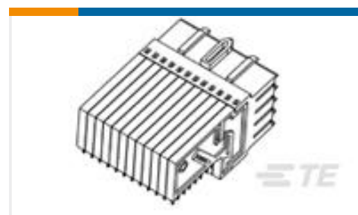
TE Part #1982738-1 Female Connector Telcordia