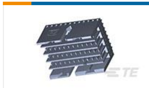
TE Part #1551012-1 Vert.Male, Telcordia L3