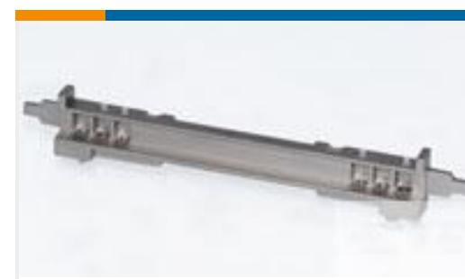
TE Part #2057592-2 CFP Guide Rail