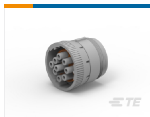
TE Part #HD16-9-96S PLG, 9P, GRY, N, THRD, 16