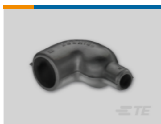
TE Part #962933-000 Bulbous Heat Shrink Boots: Lipped, Right Angle