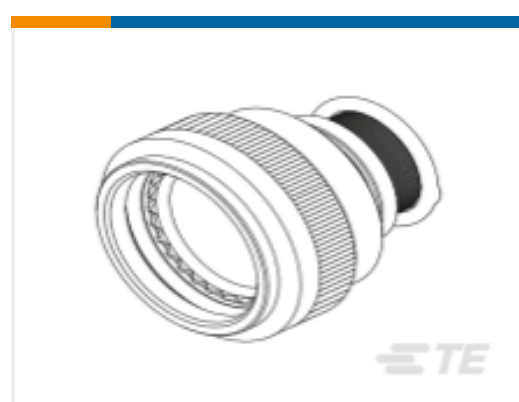
TE Part #522495-000 TXR54SJ00-2412AI