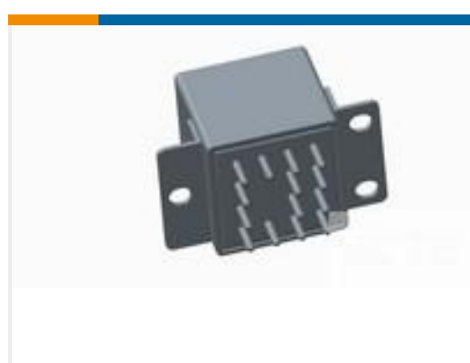
TE Part #8-1617805-8 TD231-2001P=TDAR .2-2SEC M83726 /31-2001P