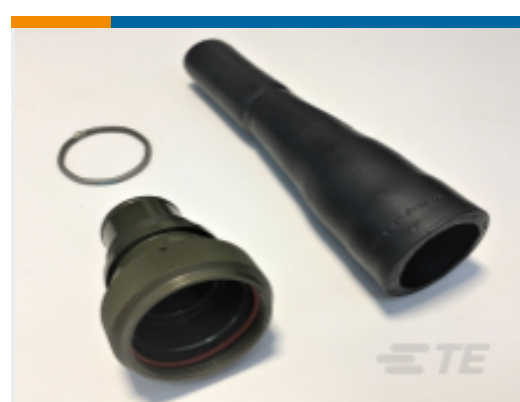
TE Part #743100-000 5420-00-230010