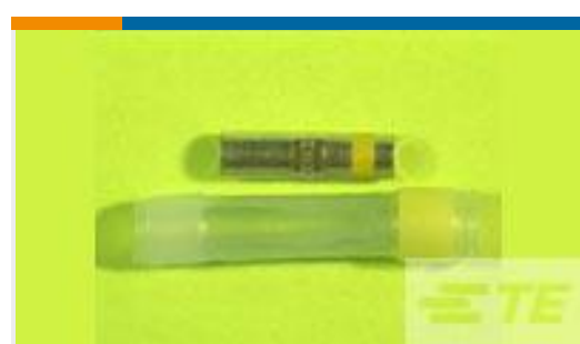
TE Part #650110-000 D-436-0128