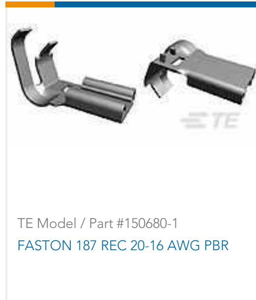
TE Model / Part #150680-1 FASTON 187 REC 20-16 AWG PBR