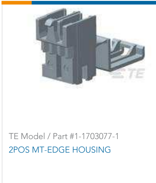
TE Model / Part #1-1703077-1 2POS MT-EDGE HOUSING