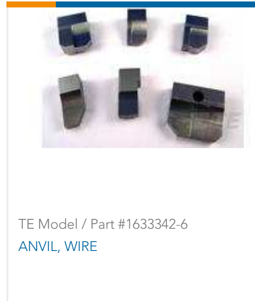
TE Model / Part #1633342-6 ANVIL, WIRE