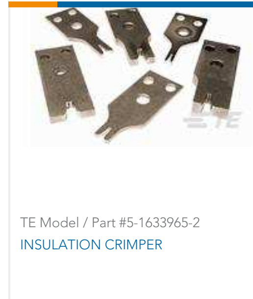
TE Model / Part #5-1633965-2 INSULATION CRIMPER