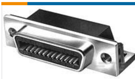
TE Part #5553813-3 ASSY,EMI RCPT,50 POSN,SCR LK