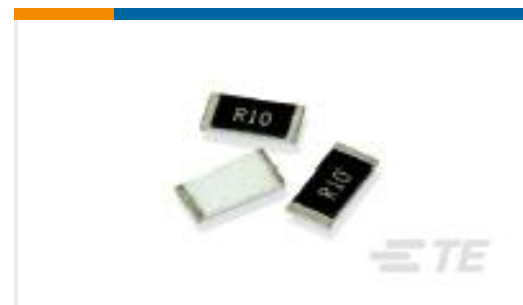
TE Part #4-1622825-6 RL73K 3A R27 5% 4K RL