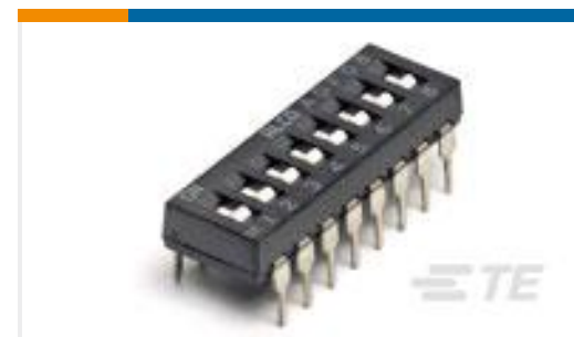
TE Part #1-1825002-7 ADF1004=DIP SWT,FLUSH,THRU/HL