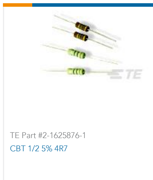
TE Part #2-1625876-1 CBT 1/2 5% 4R7