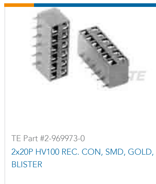
TE Part #2-969973-0 2x20P HV100 REC. CON, SMD, GOLD, BLISTER