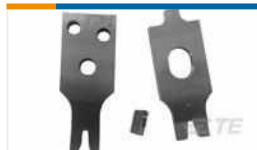
TE Model / Part #7-2150302-7 OCEAN_2.0_SPARE_PART_KIT-090F140F