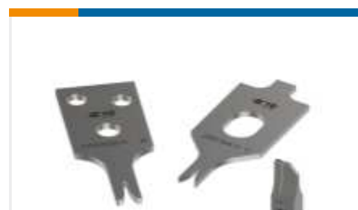
TE Model / Part #7-2150568-7 OCEAN_2.0_SPARE_PART_KIT-130F180F