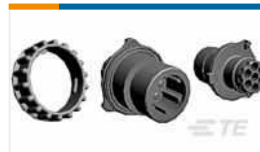
TE Model / Part #1544676-1 1.5 MM PIN HSG 7W SEALED