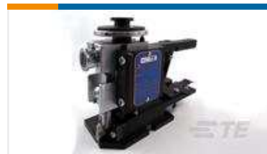
TE Model / Part #2150302-1 OCEAN_2.0_APPLICATOR-E-090F140F