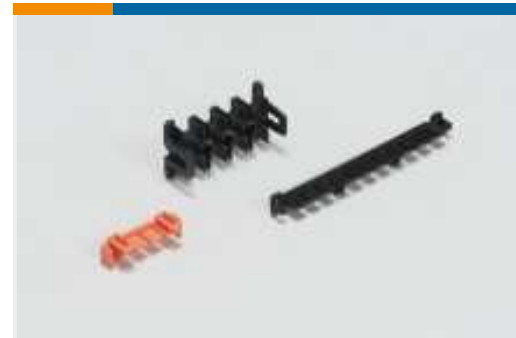
Rectangular Connector Locking(14)