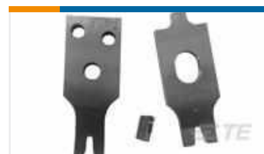
TE Model / Part #7-2151242-7 OCEAN_2.0_SPARE_PART_KIT-090F120O