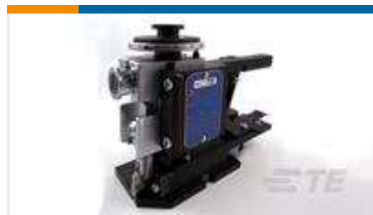
TE Model / Part #2150150-1 OCEAN_2.0_APPLICATOR-E-062O062O