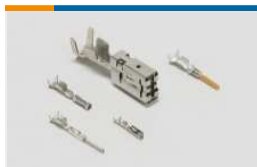
Automotive Terminals (125)