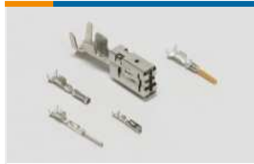
Automotive Terminals (6)