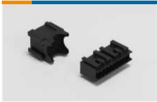
Module Components (1)