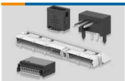
PCB Headers & Receptacles (29)