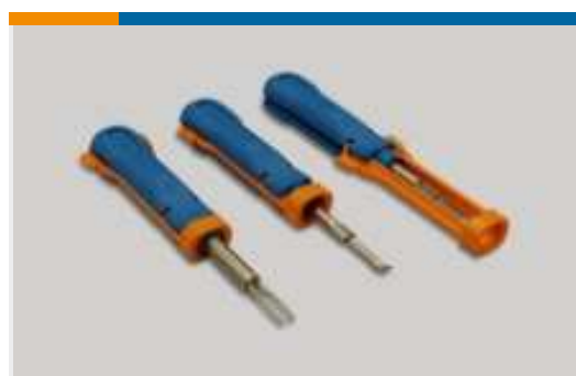
Insertion & Extraction Tools (13)