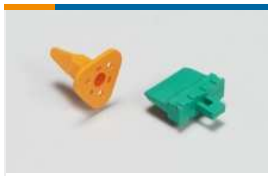
Automotive Connector Locks & Position Assurance (6)