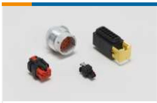
Automotive Housings (180)