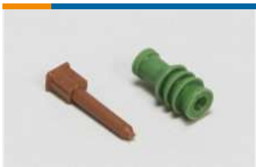
Automotive Seals & Cavity Plugs (6)