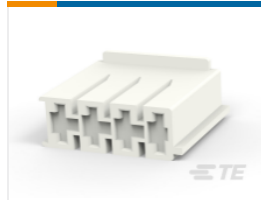
TE Part # 281370 187 FASTON HSG.,REC.,4 POS, NATURAL