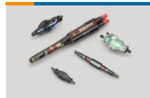
Joints & Splices(1)