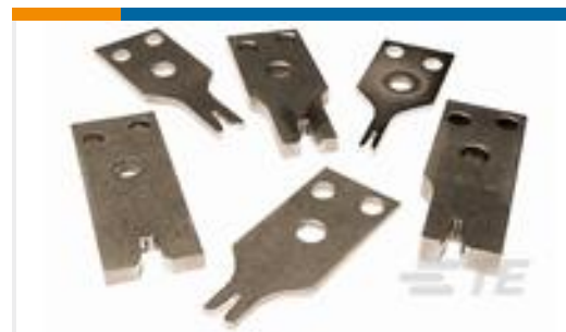
TE Part #854830-5 CRIMPER,INSULATION SP(.140 OV)