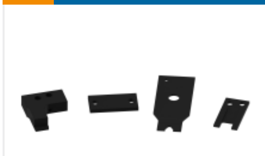
TE Part #240833-2 PLATE, REAR SHEAR