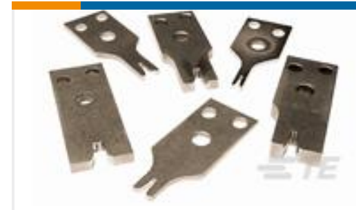
TE Part #456414-5 CRIMPER, WIRE .160 "F"