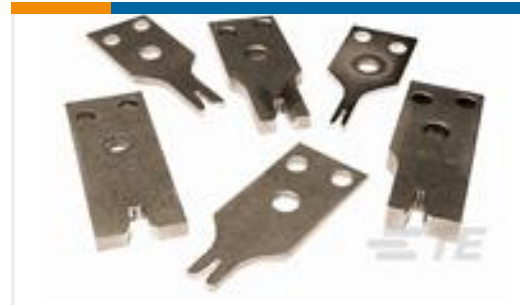
TE Part #1-456408-9 CRIMPER, WIRE .110 "F"