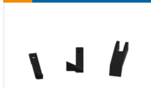
TE Part #240635-1 FINGER, FEED