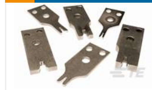
TE Part #6-1213077-9 CRIMPER, INSULATION "F"