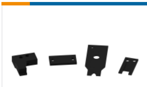
TE Part #690495-3 FRONT SHEAR PLATE