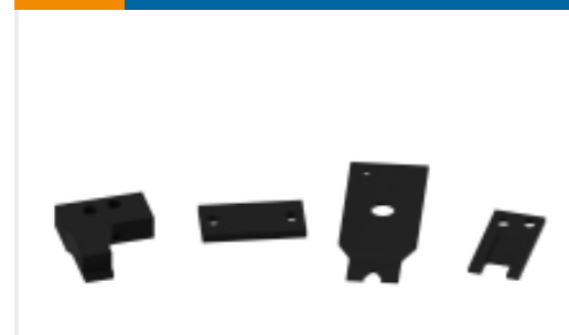
TE Part #2-690495-6 FRONT SHEAR PLATE