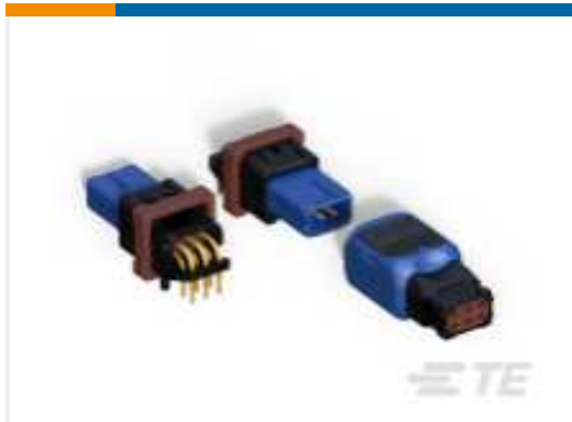
TE Model / Part #YD369-B99-AP400000 369 9 WAY PANEL MNT REC, 90 PCB GOLD,PIN