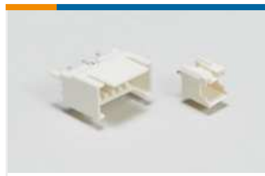
Wire-to-Board Headers & Receptacles (75)