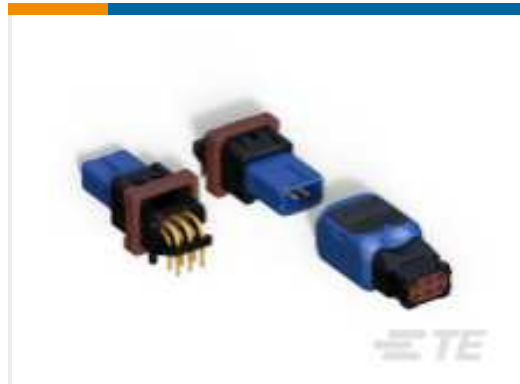
TE Model / Part #YD369-B99-NS400000 369 9 WAY PANEL MNT REC, 90 PCB GOLD,SKT