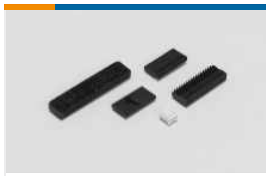
Wire-to-Board Connector Assemblies & Housings(3)