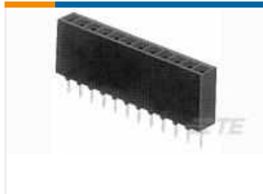
TE Model / Part #1-829265-8 18P HV100 REC.CON. B/TE,6,2,NO KINK