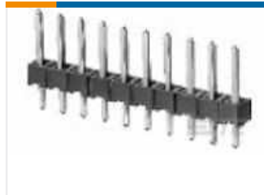
TE Model / Part #1-146285-2 12 MODII HDR SRST B/A .100CL