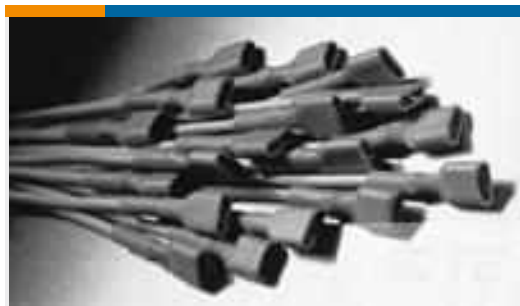
TE Model / Part #3848014001 LSTT-38-6-SP