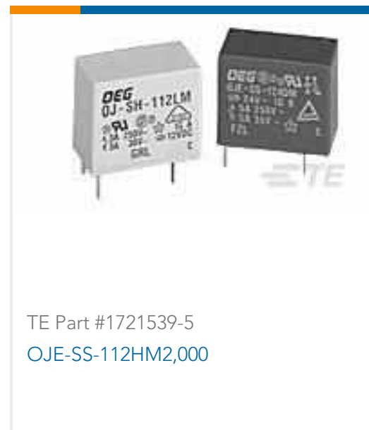
TE Part #1721539-5 OJE-SS-112HM2,000