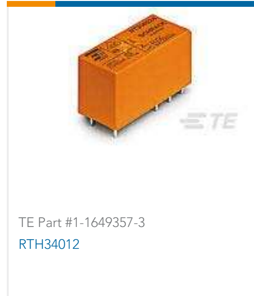
TE Part #1-1649357-3 RTH34012