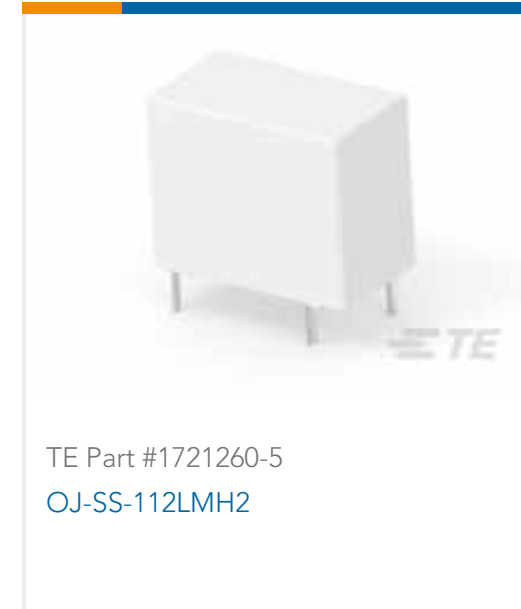
TE Part #1721260-5 OJ-SS-112LMH2