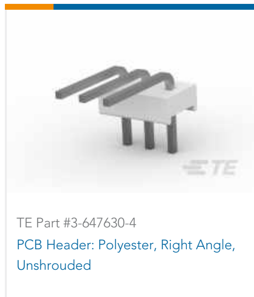
TE Part #3-647630-4 PCB Header: Polyester, Right Angle, Unshrouded