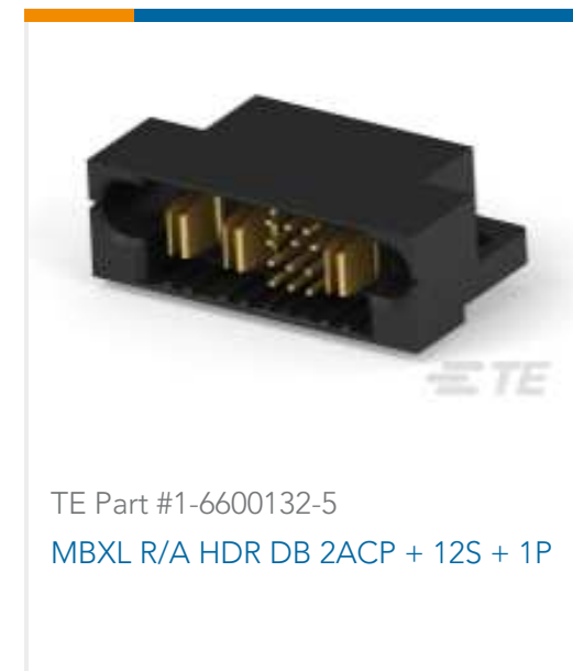
TE Part #1-6600132-5 MBXL R/A HDR DB 2ACP + 12S + 1P