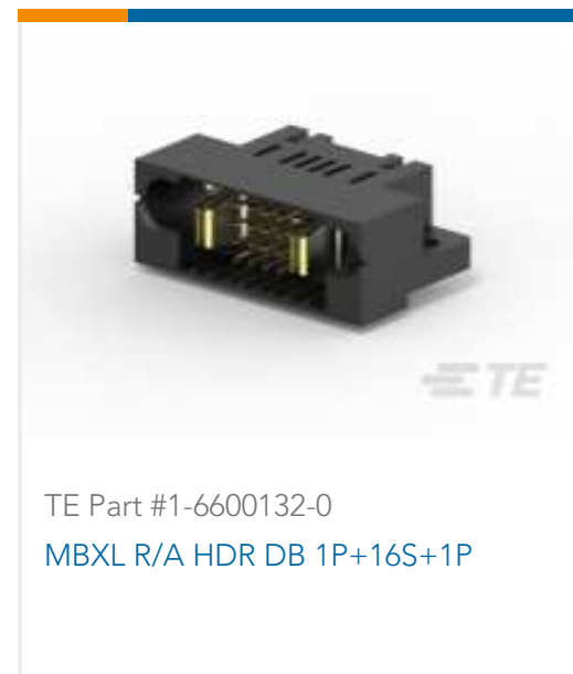
TE Part #1-6600132-0 MBXL R/A HDR DB 1P+16S+1P