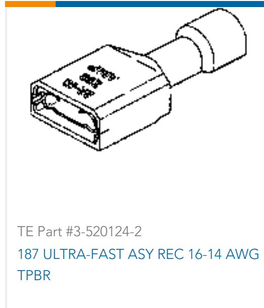
TE Part #3-520124-2 187 ULTRA-FAST ASY REC 16-14 AWG TPBR