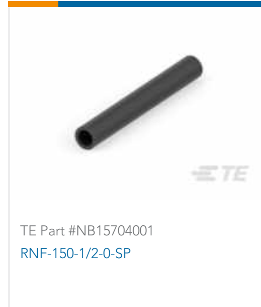
TE Part #NB15704001 RNF-150-1/2-0-SP