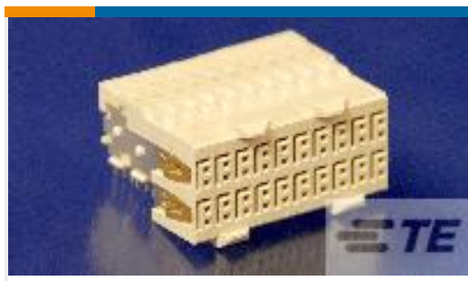
TE Part #2065769-1 Zd Plus 2 pair receptacle assy