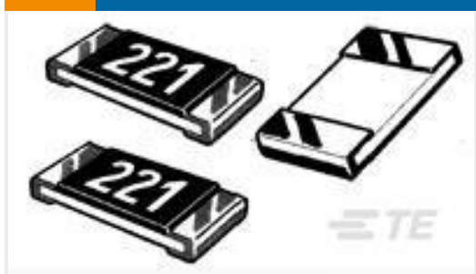
TE Part #2176070-4 3521 13R 1% 2W