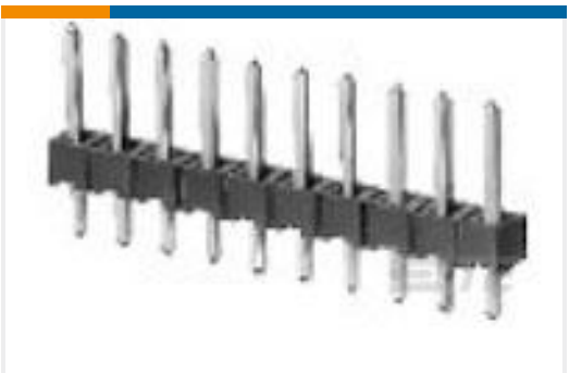
TE Part #5-146281-5 05 MODII HDR SRST B/A LF