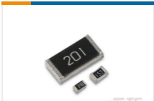
TE Part #1-2176328-6 CRGP 1206 180R 1%