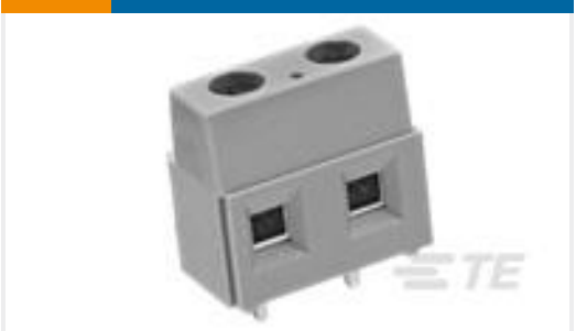
TE Part #796740-2 2 POS PCB MT 6.35MM HI CRT TBK