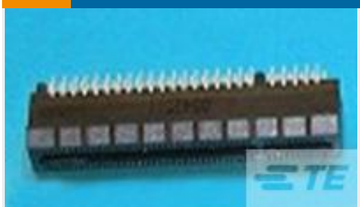
TE Part #5650118-3 CONN SEC II 6 POS 100C/L R/A