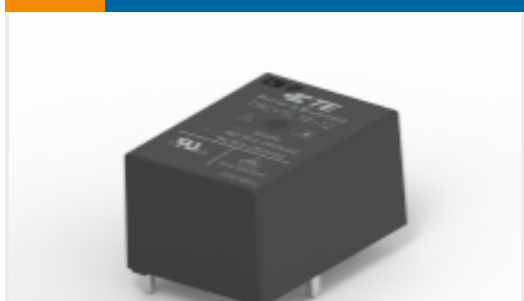
TE Part #1558666-3 T9GS1L14-12