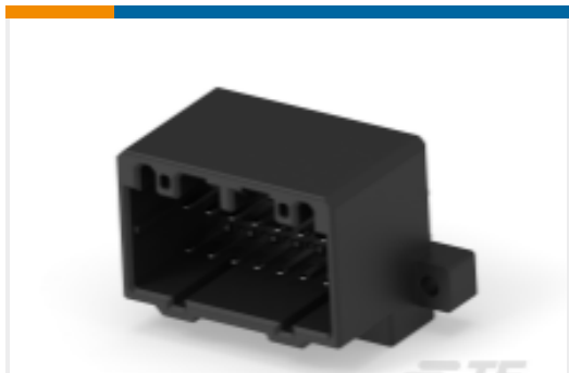
TE Part #9-1456610-2 16P 040 VERT HYBRID CAP ASSY