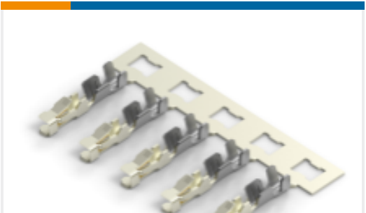
TE Part #5-2316113-5 2MM,REC,CNT,CRIMP,24-28AWG,0.76UM,APPL