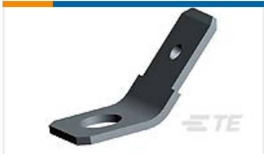
TE Part #181949-2 250 FASTON,TAB,TPBR