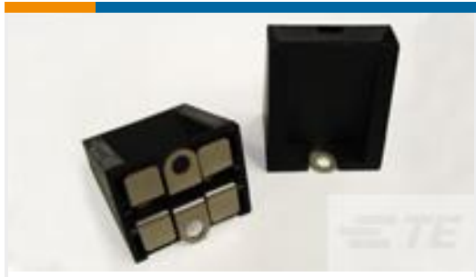
TE Part #1643903-1 CC - CROWN CLIP Senior II 538-0068-00100