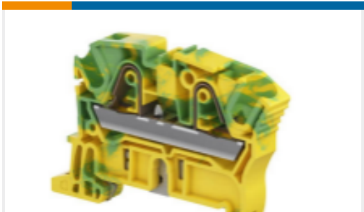
TE Part #1SNK708150R0000 ZK6-PE