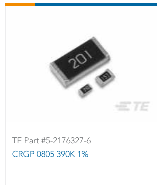
TE Part #5-2176327-6 CRGP 0805 390K 1%