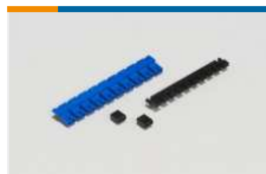
Board-to-Board Jumpers & Shunts(5)