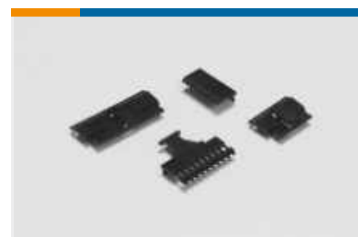
PCB Connector Covers(4)