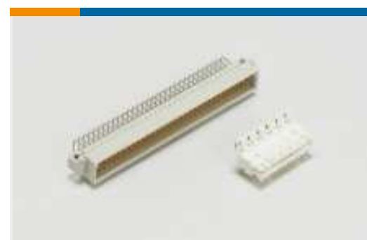
Standard Edge Connectors(2)