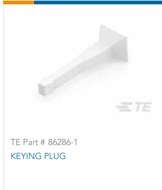
TE Part # 86286-1 KEYING PLUG