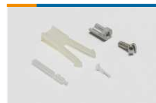
PCB Connector Keying(4)