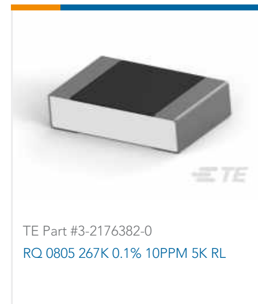
TE Part #3-2176382-0 RQ 0805 267K 0.1% 10PPM 5K RL