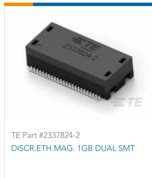
TE Part #2337824-2 DISCR.ETH.MAG. 1GB DUAL SMT