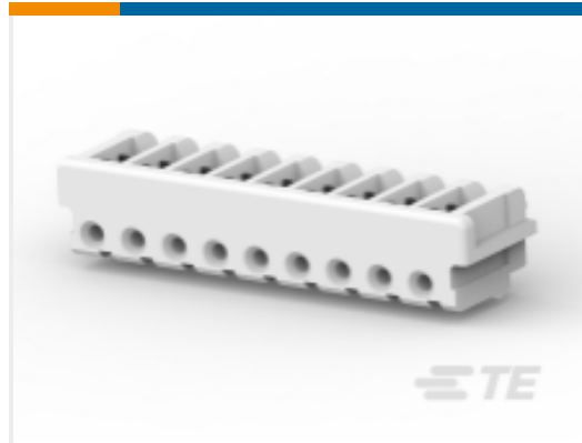
TE Part # CAT-AM7017-H8172 AMP COMMON TERMINATION HOUSINGS