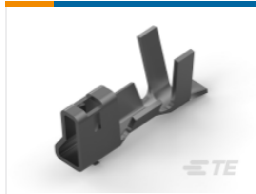
TE Part # CAT-AM7017-C7671 Common Termination Contacts — POWER TRIPLE LOCK