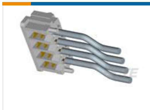
TE Part #173977-7 CT CONN MT REC ASSY 7P