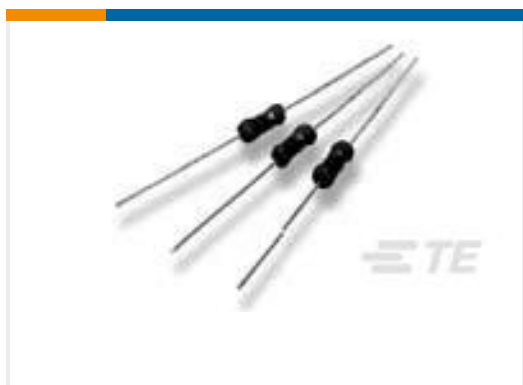
TE Part #5-1879350-0 RR01 5% 24R AMMO