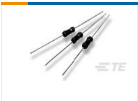
TE Part #5-1879350-2 RR01 5% 30R AMMO