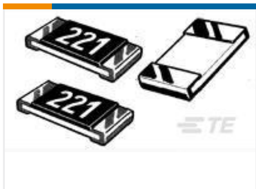
TE Part #8-2176231-3 3522 27K 1% 3W