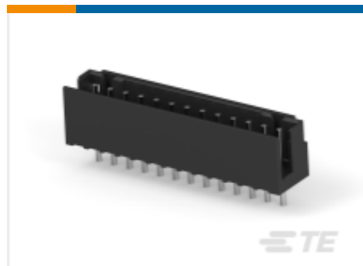
TE Part #292132-5 CT 2mm Post Header Asmbly: Box V DIP