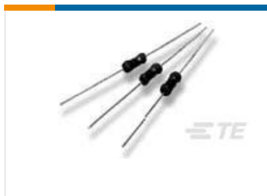
TE Part #4-1879350-7 RR01 5% 18R AMMO