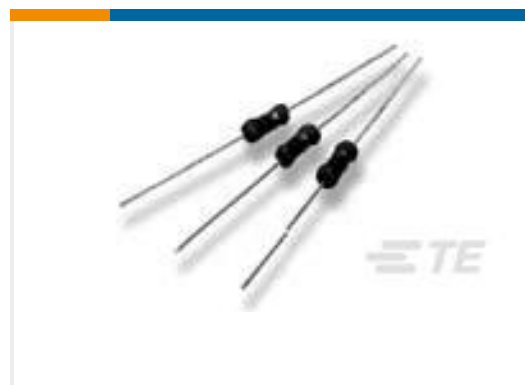
TE Part #4-1879350-5 RR01 5% 15R AMMO