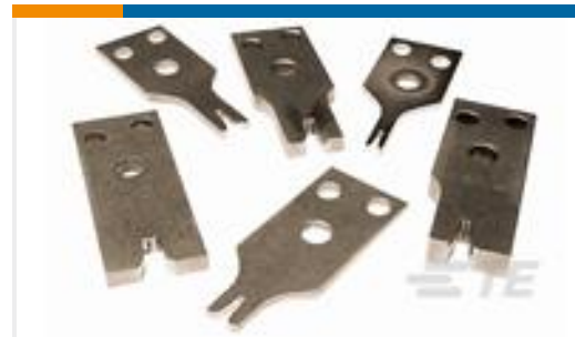
TE Part #1-1633961-2 CRIMPER, INSULATION F PREMIUM