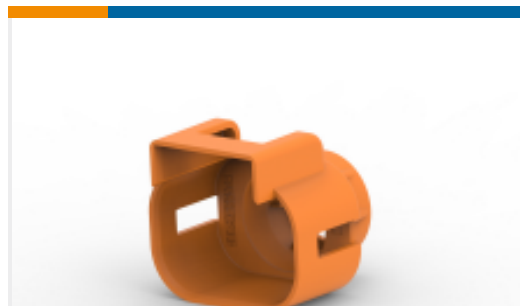
TE Part #2103013-3 CABLE SEAL RETAINER, SIZE 2, OR, HVA280