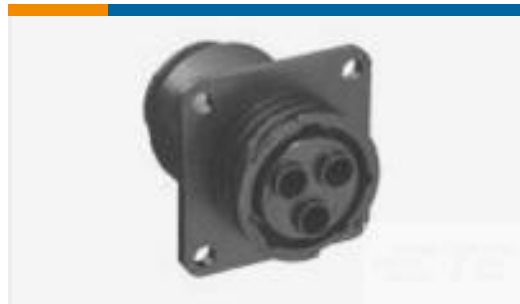
TE Part #788189-2 CPC 17-3 RCPT ASY,REV SEX