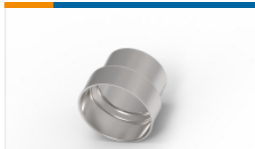
TE Part #2177090-3 STEEL, OUTER FERRULE, 8MM HV, 25SQMM