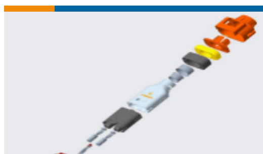
TE Part #YHV280-2PM-P-4MM-B HVA280-2pnm, pass, 4sqmm, Key B