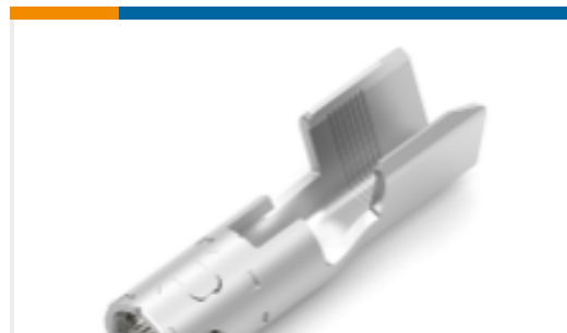
TE Part #2208669-3 8MM HV, CONTACT, ASSY