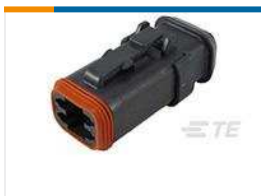
TE Part #DT06-4S-CE13 PLG, 4P, BLK, E, SEAL RET, XCAP