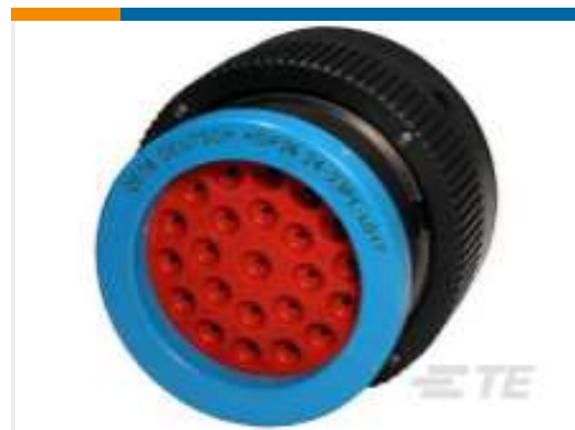
TE Part #HDP26-24-23PE-L017 PLG, 23P, BLK, E, RNG, 16, P