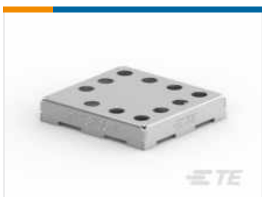
TE Part #2118706-4 1 PC STD SHIELD, AL-13.66X12.70X2.54MM