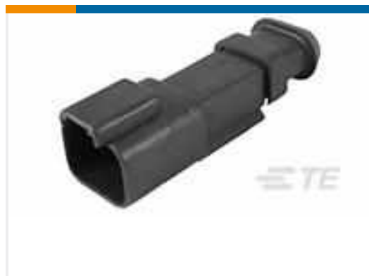
TE Part #DT04-2P-CE09 REC, 2P, BLK, E, XCAP