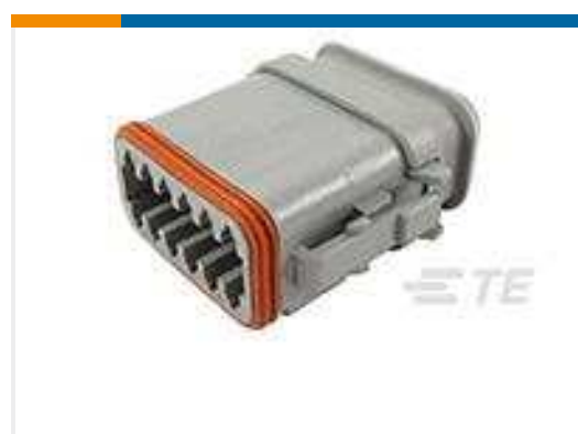
TE Part #DT06-12SA-E008 PLG, 12P, GRY, N, XCAP, A