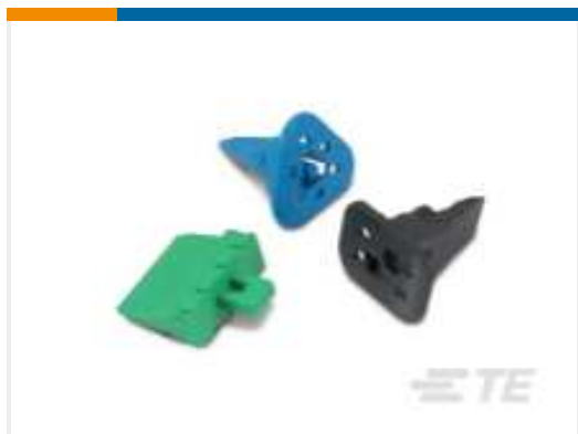
TE Part #W3S-1939-P012 DEUTSCH DT Wedgelocks