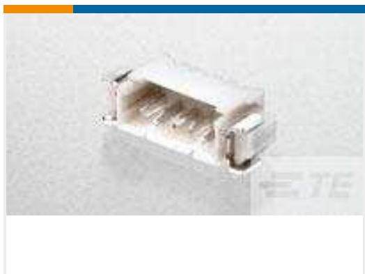
TE Part #1734261-5 1.25 WTB, HDR, SMT, RA, 5P