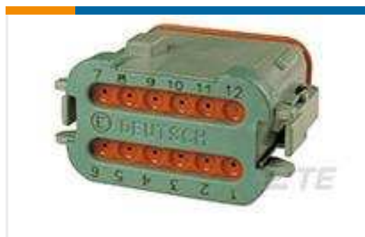
TE Part #DT06-12SC-CE05 PLG, 12P, GRN, E, SEAL RET,ENH KEY, CAP,C