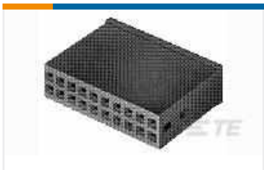
TE Part #925370-3 MOD IV REC HSG, 2X3P