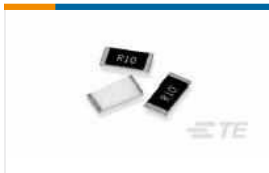
TE Part #2-1622825-1 RL73K 3A R39 5% 1K RL