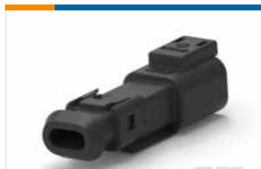
TE Part #2-2303812-4 DT04-2P-TE82, REC, 2P, BLK, E, SNAPXCAP