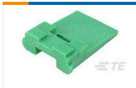
TE Part #W2P WEDGE LOCK, 2P, REC, GRN, DT