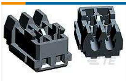
TE Part #353293-9 MINI CT MT REC ASSY 9P GRAY