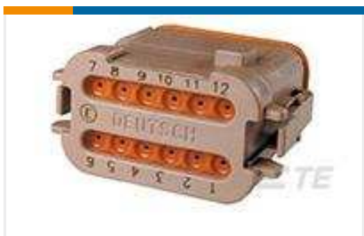
TE Part #DT06-12SD-CE05 PLG, 12P, BRN, E, SEAL RET,ENH KEY, CAP,D