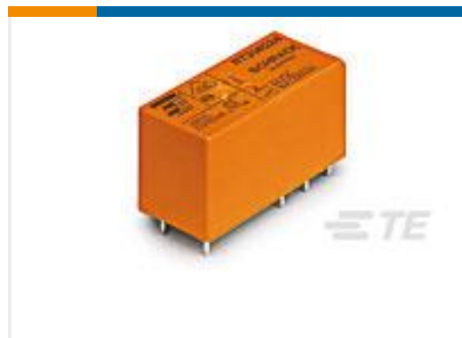
TE Part #1-1415543-5 RTE44110