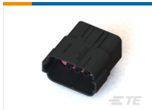
TE Part #ZPF000000000136485 RECEPTACLE MALE FOR 12 PINS, CAL1,6