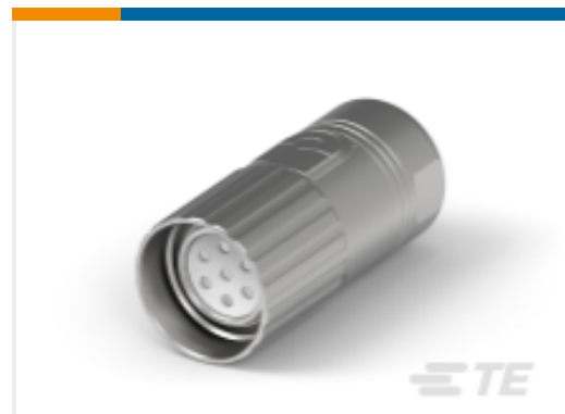
TE Part #ASA158F12390235000 623 PLUG