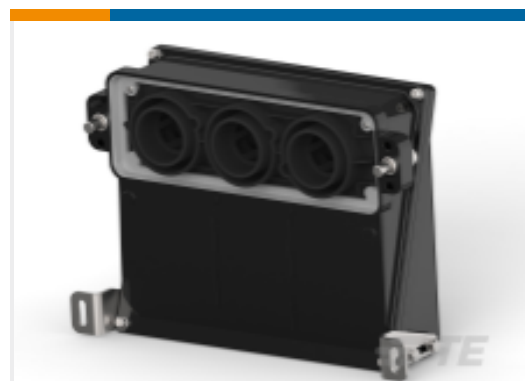
TE Part #ZPF000000000205373 PLUG MALE ANG.90 CAL.20 - FXP