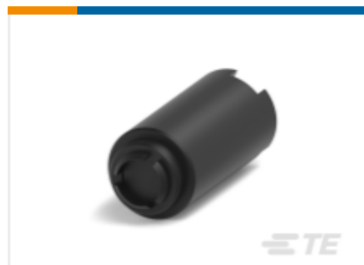
TE Part #YZ-KC-212751A-PY00 TOOL DISMOUNTING - FXP2