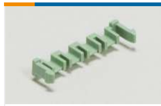
PCB Latches, Locks & Retainers(5)