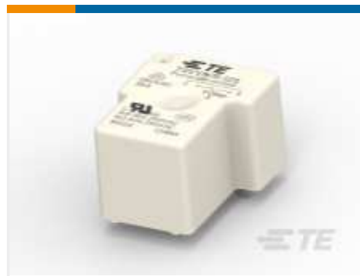
TE Part #2027395-5 T9W1K15-12S