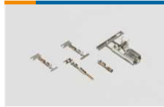
Wire-to-Board Connector Contacts(4)