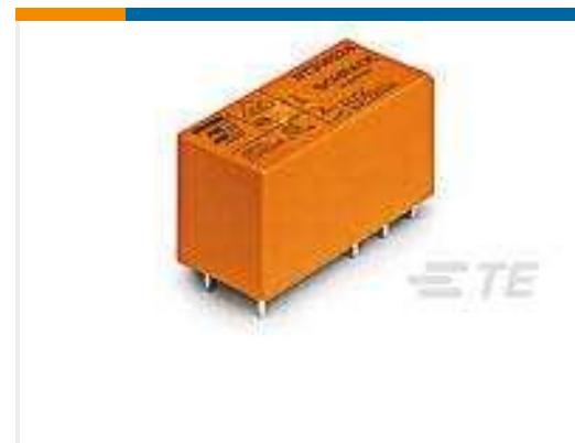
TE Part #1-1649357-3 RTH34012