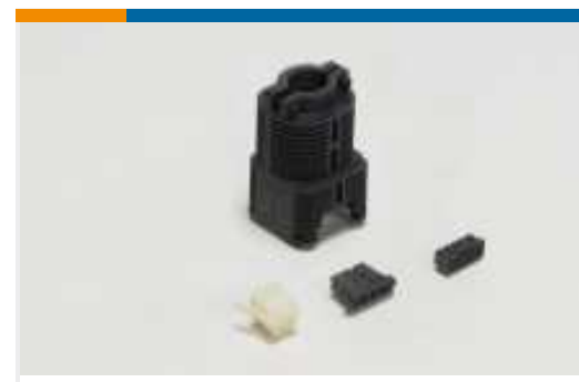
Rectangular Connector Housings(49)