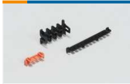
Rectangular Connector Locking(2)