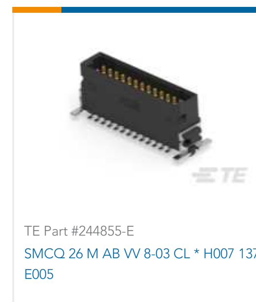
TE Part # 244855-E SMCQ 26 M AB VV 8-03 CL * H007 137 E005