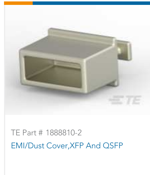
TE Part # 1888810-2 EMI/Dust Cover, XFP And QSFP