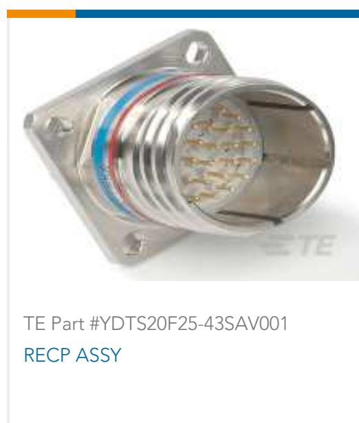
TE Part # YDTS20F25-43SAV001 RECP ASSY