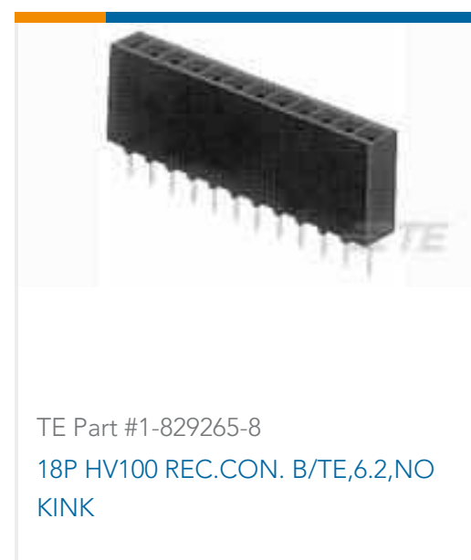
TE Part # 1-829265-8 18P HV100 REC.CON. B/TE,6.2,NO KINK