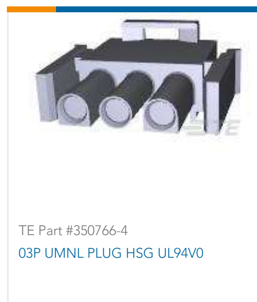
TE Part # 350766-4 03P UMNL PLUG HSG UL94V0