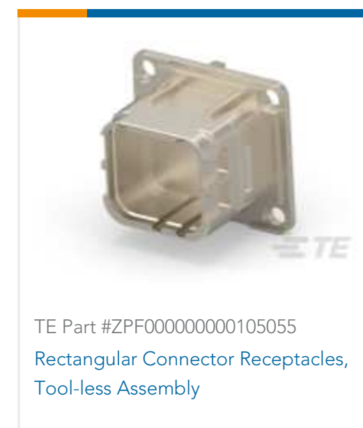
TE Part # ZPF00000000105055 Rectangular Connector Receptacles, Tool-less Assembly