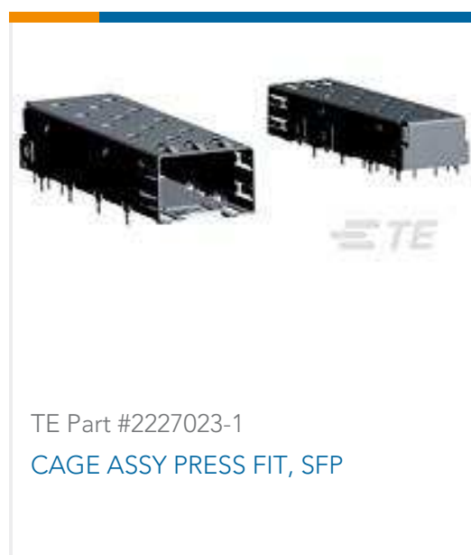
TE Part # 2227023-1 CAGE ASSY PRESS FIT, SFP