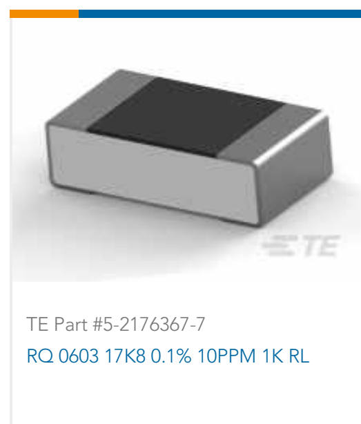
TE Part # 5-2176367-7 RQ 0603 17K8 0.1% 10PPM 1K RL