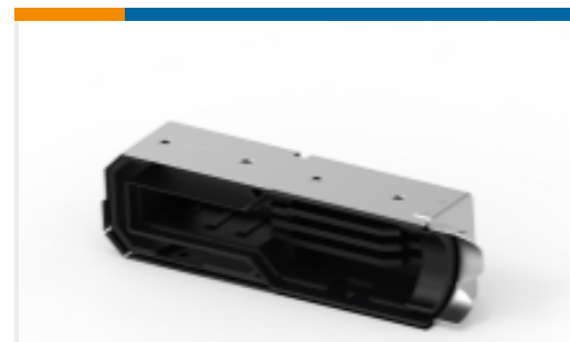
TE Part #2-2344525-1 2POS,21MM,UPPER HSG,90 DEG,ASSY