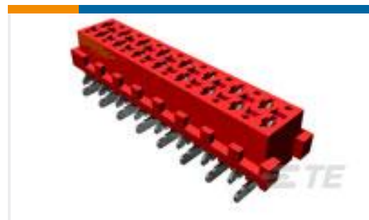
TE Part #188275-6 MICRO-MATCH SMD FTE