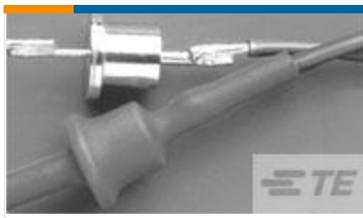
TE Part #5677602006 RNF-3000-24/8-0-STK