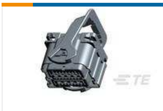
TE Part #1-2098923-3 SDM,24P PLUG ASY,LHL,KEY A