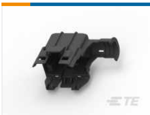
TE Part #1924002-1 Wire Guide, 34 Way, Left Out