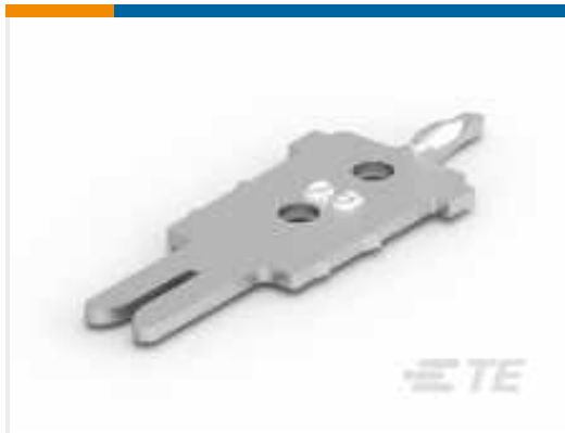
TE Part #1-1670195-2 AP 0,63 X 0,8