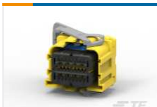
TE Part #2203516-9 PLUG ASY,24P,SDM30,LHL,KEY A