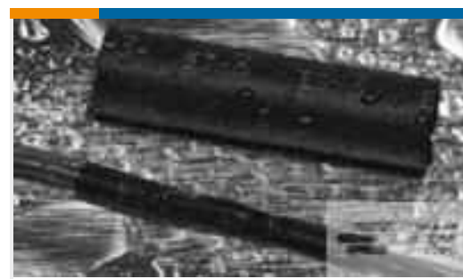
TE Part #636901P034 QS1500-NO.3-F7-0-40MM