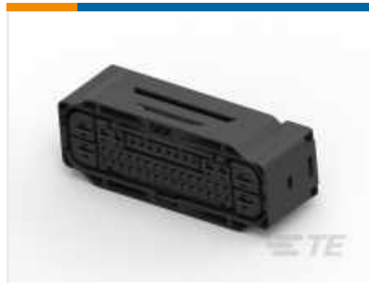
TE Part #2209520-7 46POS. REC HOUSING ASSY