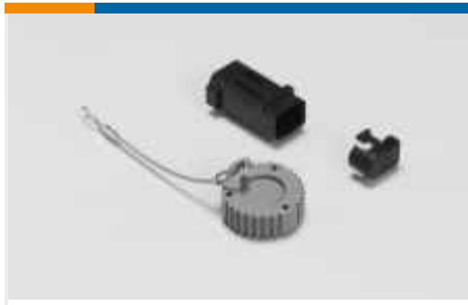
Automotive Connector Caps & Covers (16)