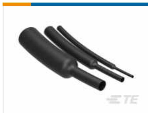
TE Part #5069836086 CGPT-4.8/2.4-0-50MM