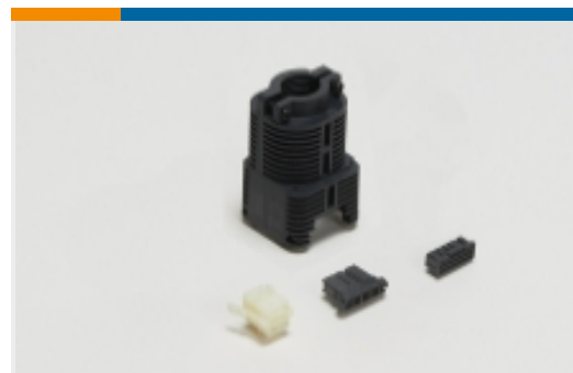
Rectangular Connector Housings(2)