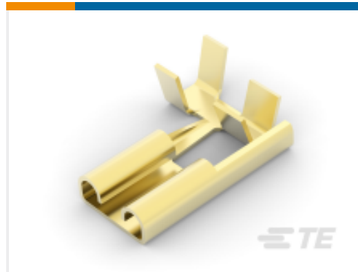
TE Part # 180464-1 250 FASTON,FLAG,REC.,14-17AWG, LATON