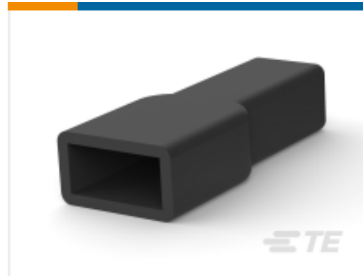
TE Part # 2-180930-5 250 FASTON HSG.,REC.,1 POS,BLACK