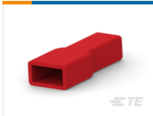
TE Part # 2-180930-1 250 FASTON HSG.,REC.,1 POS,RED