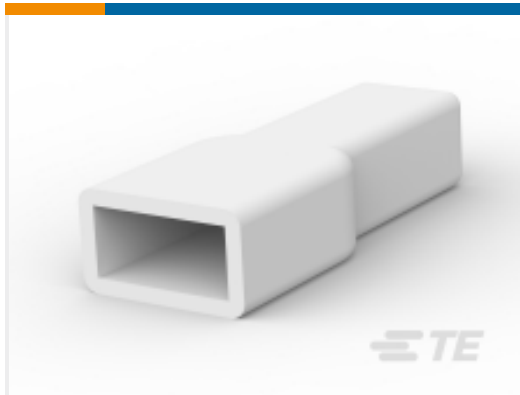
TE Part # 2-180930-0 250 FASTON HSG.,REC.,1 POS, NATURAL