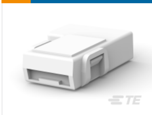
TE Part # 8-180984-2 250 FASTON BOOT FLAG REC. 1P NATURAL