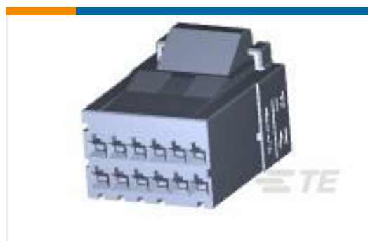
TE Part #1-1318118-6 DYNAMIC D-2100 REC HSG 12P