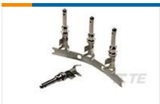
TE Part #1060-12-0166 PIN, SF, SIZE 12, 12-14, NI/SN