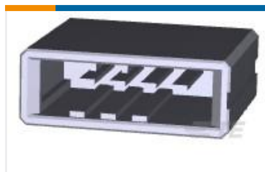
TE Part #2-178314-2 DYNAMIC D3100 HDR ASSY 4P V K/Y