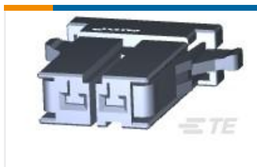
TE Part #2-178128-2 DYNAMIC 3200 REC HSG 2P SGL Y