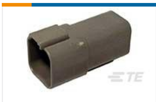
TE Part #DT04-6P REC, 6P, GRY, N