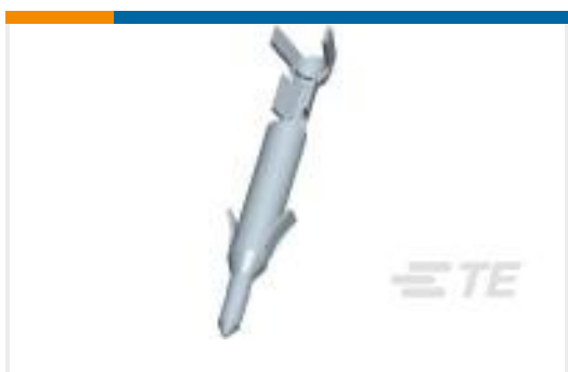
TE Part #170359-1 UNIV M-N-L PIN 26-22 AWG