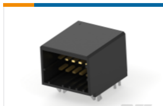
TE Part #1318124-2 DYNAMIC 2000 HDR ASSY