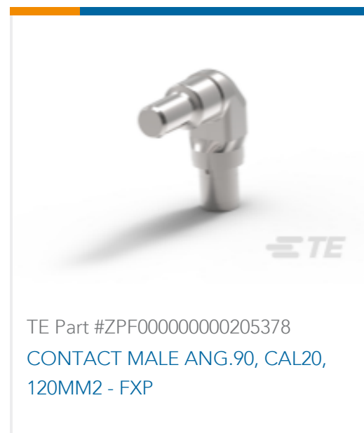
TE Part #ZPF000000000205378 CONTACT MALE ANG.90, CAL20, 120MM2 - FXP