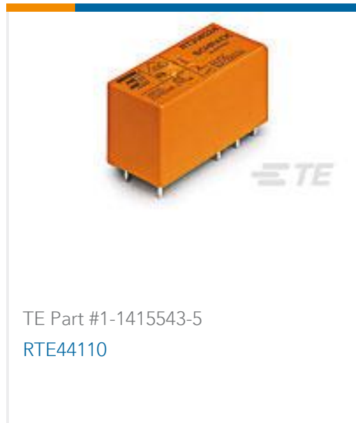
TE Part #1-1415543-5 RTE44110