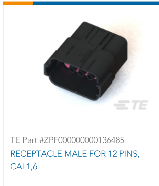
TE Part #ZPF000000000136485 RECEPTACLE MALE FOR 12 PINS, CAL1,6