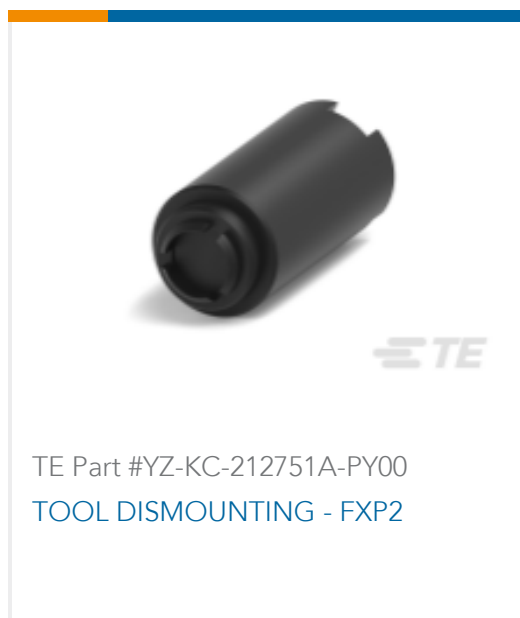
TE Part #YZ-KC-212751A-PY00 TOOL DISMOUNTING - FXP2