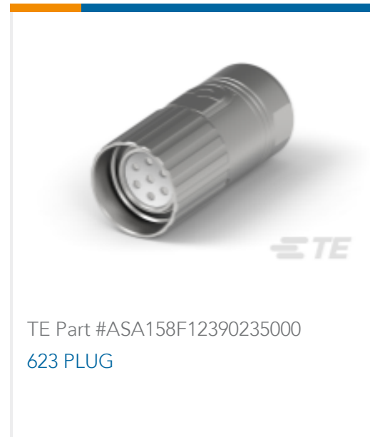
TE Part #ASA158F12390235000 623 PLUG