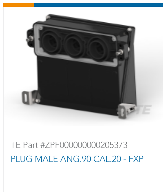
TE Part #ZPF000000000205373 PLUG MALE ANG.90 CAL.20 - FXP