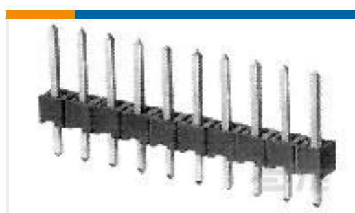
TE Part #826629-5 AMPMODU II HEADER