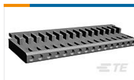
TE Part #926475-4 MOD 4 HSG