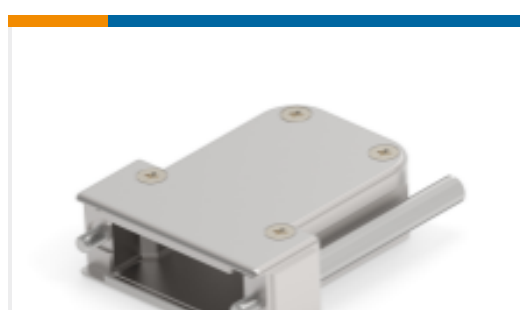
TE Part #1-2308341-5 FULL METAL HOODS SIZE 2-5 (RAW 180 DEG)