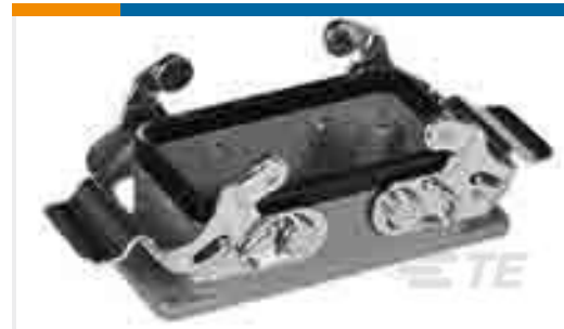
TE Part #1102291-9 HB.24.AG-LB