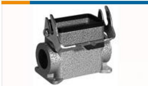
TE Part #1-1106451-3 HD.40.SG-LB.2.M32.Z+BS