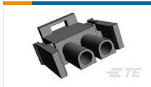
TE Part #1-480698-0 02P UMNL PLUG HSG NATL