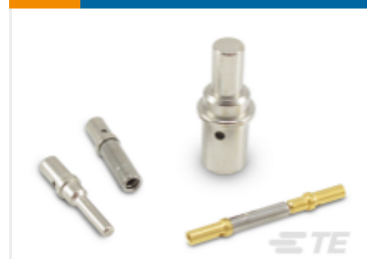
TE Part #0462-201-20141 DEUTSCH Solid Contacts