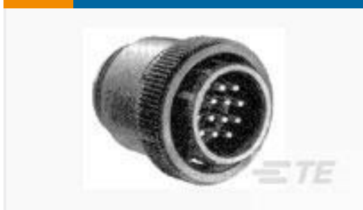
TE Part #206429-1 CPC PLUG ASSY, 11-4, REV SEX