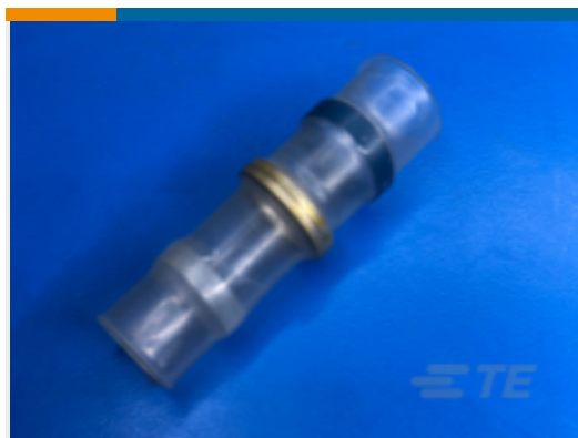
TE Part #F09513-000 B-155-11-S