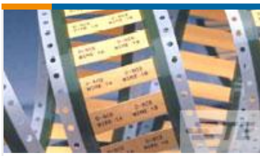
TE Part #949459-000 D-SCE-1K-38-50-4