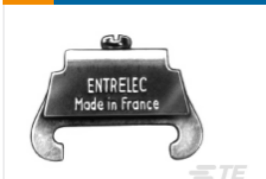
TE Part #1SNA167489R2200 BAH21