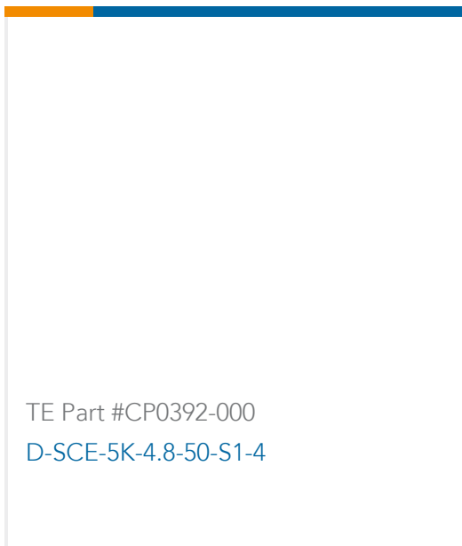
TE Part #CP0392-000 D-SCE-5K-4.8-50-S1-4