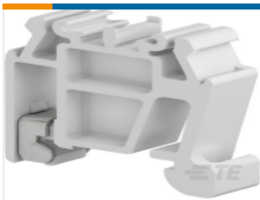
TE Part #1SNA199420R2100 BADRL