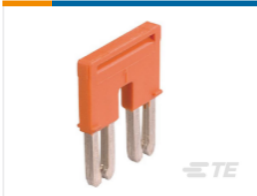
TE Part #1SNA291106R2700 BJDL5-6