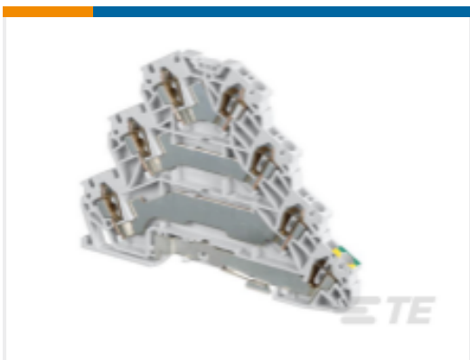
TE Part #1SNA290458R1200 D2.5/5.T3.P.L