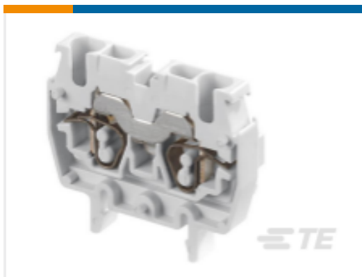
TE Part #1SNA290201R1100 DR2.5/5.2L