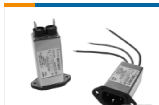
TE Part #2-6609006-2 IEC Filtered Inlets, Corcom EJT Series