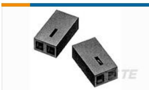
TE Part #390088-1 BLACK HSG WITH 30AU CONTACT