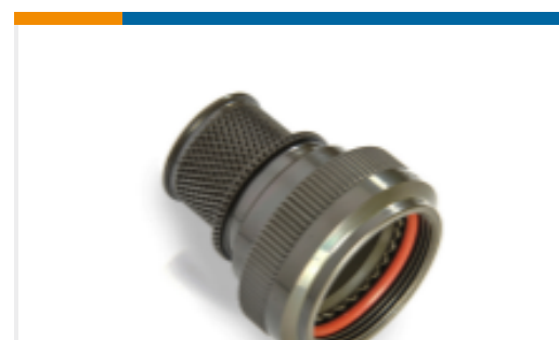
TE Part #EK4829-000 91H1-11-06-1-ZN-HE100