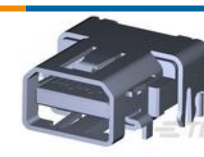
TE Part #2129320-3 Mini Displayport Reverse Offset