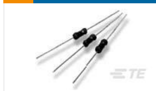
TE Part #1-1879350-3 RR01 5% R68 AMMO