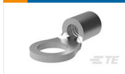
TE Part #33462 TERMINAL,SOLIS R 8 5/16