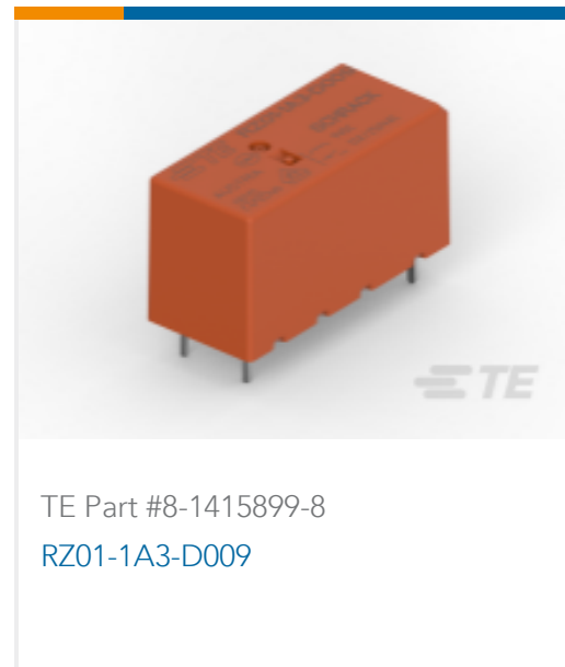
TE Part #8-1415899-8 RZ01-1A3-D009