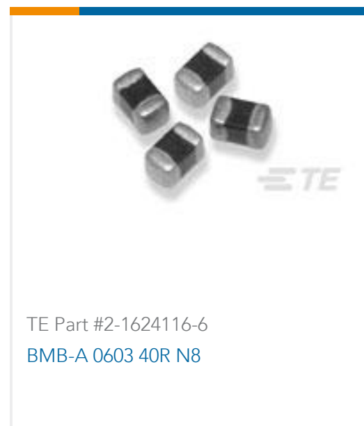
TE Part #2-1624116-6 BMB-A 0603 40R N8