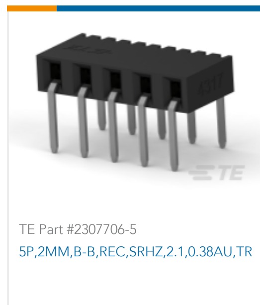
TE Part #2307706-5 5P,2MM,B-B,REC,SRHZ,2.1,0.38AU,TR