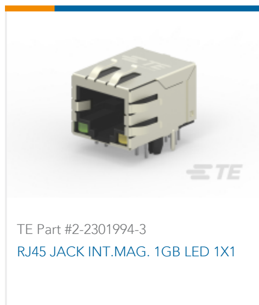
TE Part #2-2301994-3 RJ45 JACK INT.MAG. 1GB LED 1X1