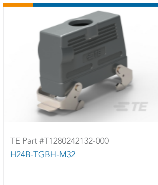
TE Part #T1280242132-000 H24B-TGBH-M32