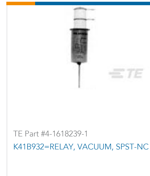
TE Part #4-1618239-1 K41B932=RELAY, VACUUM, SPST-NC