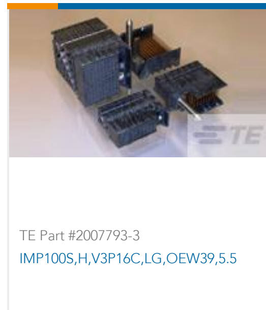
TE Part #2007793-3 IMP100S,H,V3P16C,LG,OEWS39,5.5