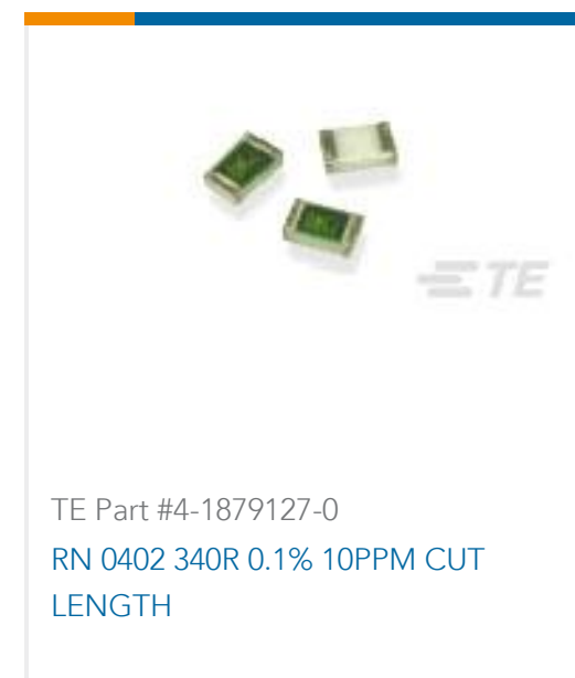
TE Part #4-1879127-0 RN 0402 340R 0.1% 10PPM CUT LENGTH