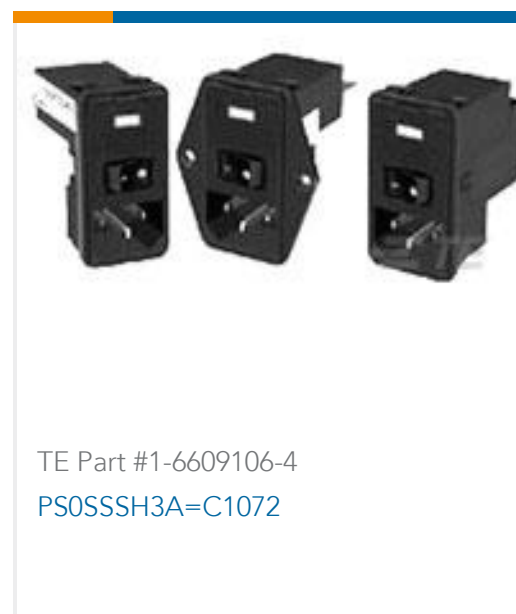
TE Part #1-6609106-4 PS0SSSH3A=C1072