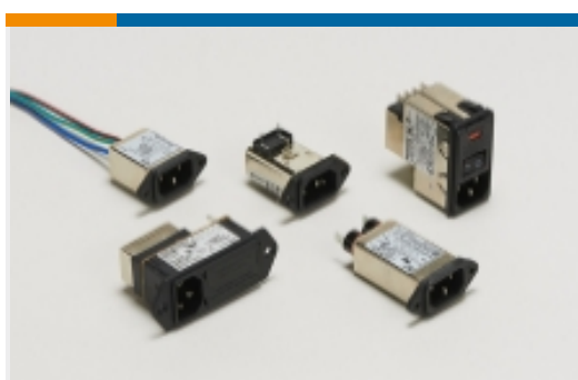
Multi-Function Inlet Filters(32)