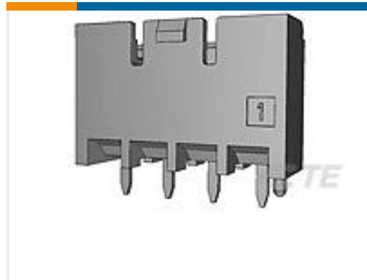
TE Part #1376384-1 5mm B-T-W Conn. 4P HDR ASSEMBL