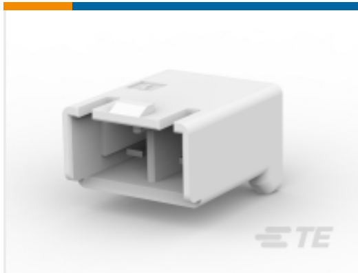
TE Part #1-1376383-2 STD Temp Power Key Header