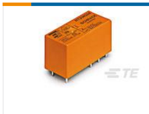
TE Part #8-1833003-5 RT424012WG