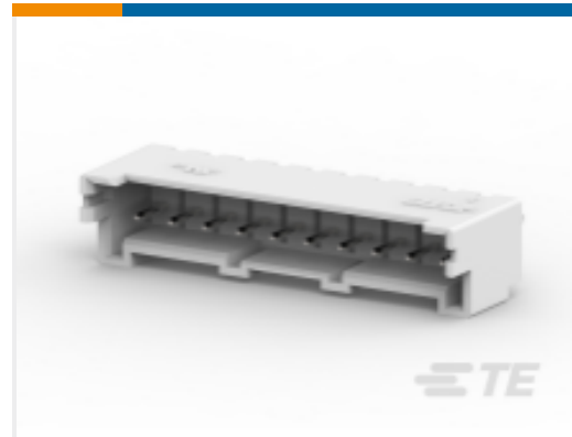
TE Part #1-1969730-0 EP2.5 SHROUDED HDR ASSY 10P VERTICAL