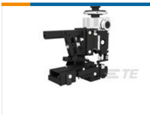
TE Part #2151058-1 OCEAN_2.0-APPLICATOR-S-080F1000