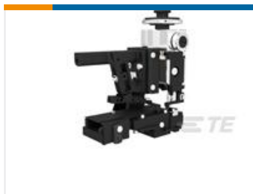
TE Part #2151188-1 OCEAN-2.0-APPLICATOR-S-070F0900