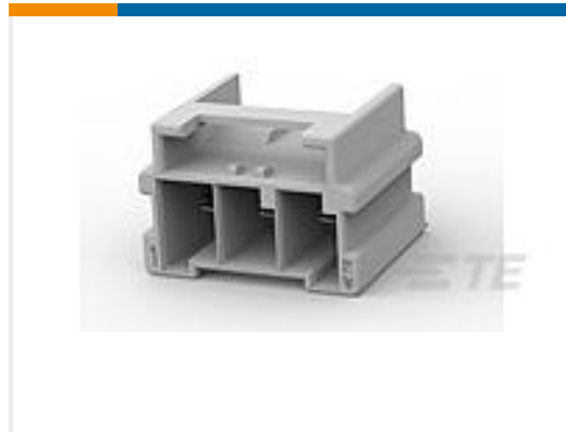
TE Part #1-1969688-3 PTL 1X3 PCB HEADER VERT HITEMP KEY A LGR