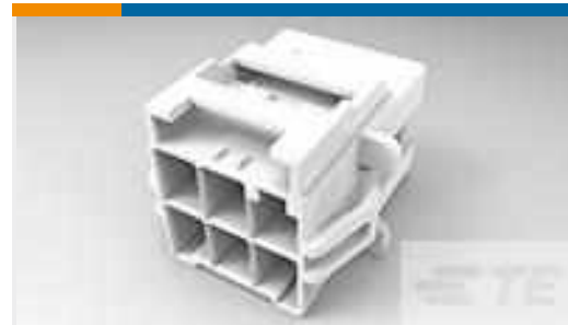
TE Part #1-1971775-3 PTL 2X3 CAP PANEL MT STD TEMP KEY A NAT