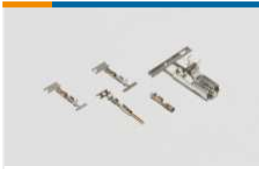
Wire-to-Board Connector Contacts(6)