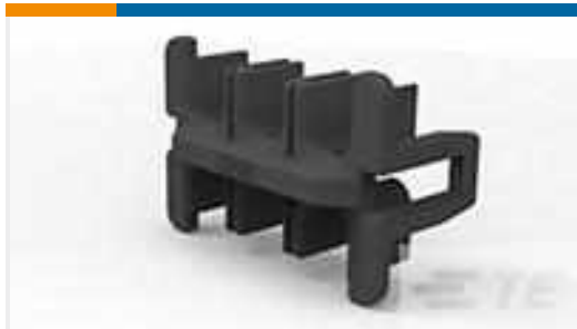
TE Part #1971778-3 PTL TPA HIGH TEMP 2 x 3 BLACK