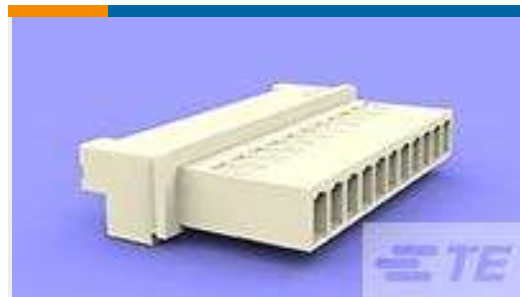
TE Part #1969588-3 HSG, REC, FREE-HANGING, SINGLE ROW, EP2.5