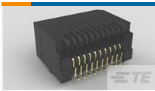
TE Part #1658197-1 SFP, 20 POSN, 0.8MM PITCH, SUR