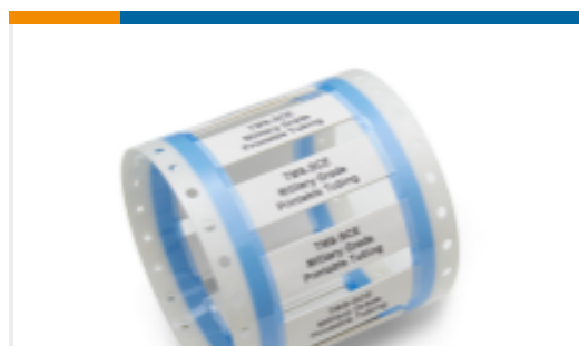
TE Part #8350110001 TMS-SCE Military Grade Sleeves