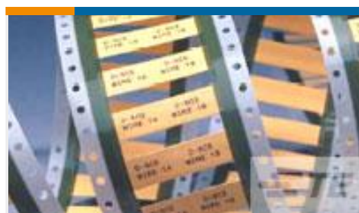
TE Part #405309-000 D-SCE-1K-12-50-S1-9