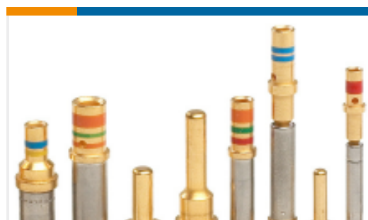
TE Part #2562-201-2031L CONT SOC ASSY