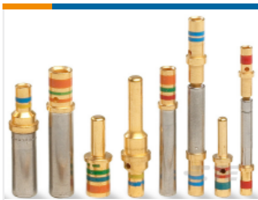
TE Part #2562-201-2031L CONT SOC ASSY