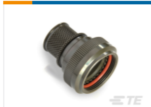
TE Part #EK4848-000 91H1-25-16-1-B-HE300