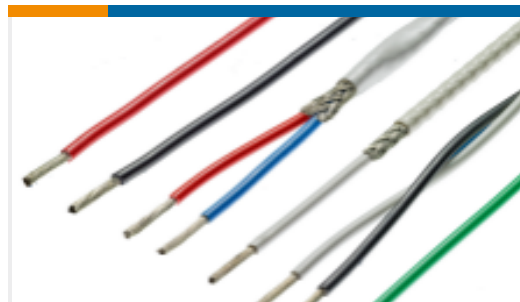
TE Part #3830943001 44A0131-16-0/2/9