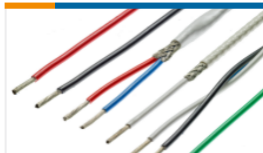
TE Part #2650503004 44A0811-8-9