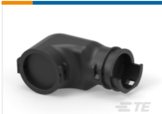
TE Part #2357921-1 BACKSHELL,CONN KIT