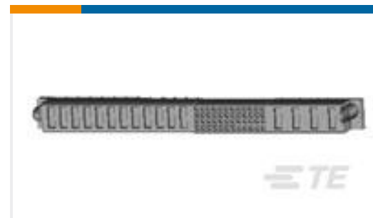
TE Part #6450863-5 MBXLE VERT RCPT 7ACP