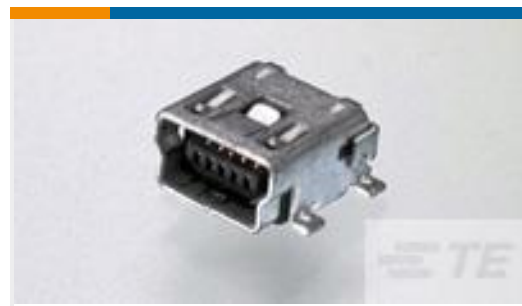
TE Part #1-1734035-2 MINI USB, TYPE B, R/A, SMT