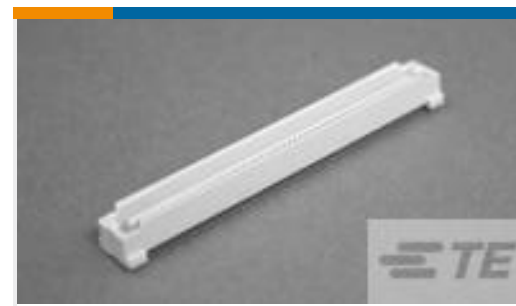
TE Part #5177984-6 0.8FH,P05H.5,140,08/Sn,TU