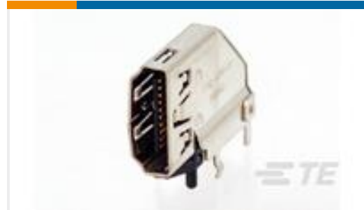
TE Part #2007435-3 Std HDMI, Flag, T/H